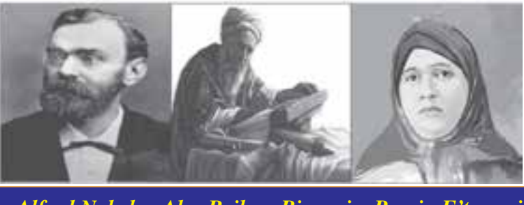
Alfred Nobel Abu-Reihan Birooni Parvin E'tesami

People have always been interested in reading about great men and women. They want to know what makes such people famous. This lesson introduces two of them.